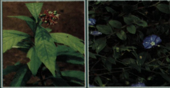
Sarpagandha (Rauwolfia serpentina) Shankhapushpi (Convolvulus pluricaulis)