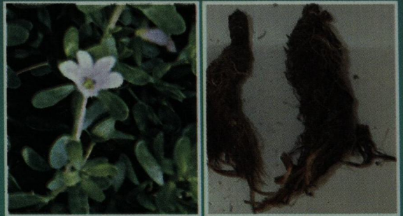
Brahmi (Bacopa monnieri)